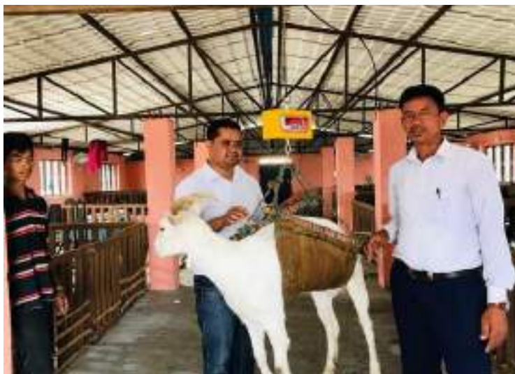
Figure 1. Saanen kid weight measurement